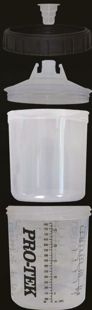
Cup System / Système de godet / Sistema de recipiente

The Spray Gun of your choice with the System of your choice Le pistolet à peindre de votre choix avec le système de votre choix La pistola de pintura que elijas con el sistema que elijas